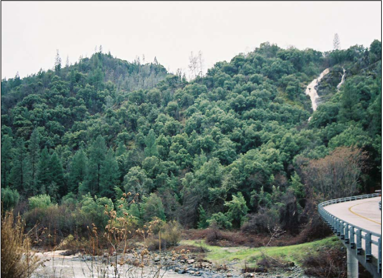
Photo 1. Iowa Hill Rd. Bridge at N. Fork American River with sediment-laden waterfall