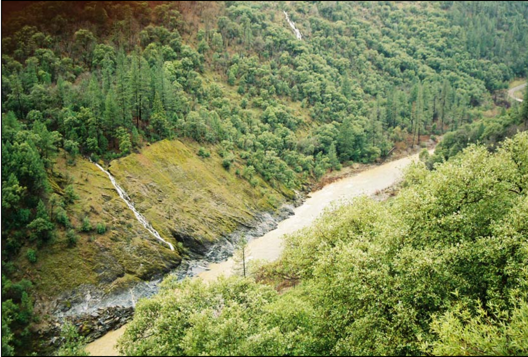
Photo 3. Extreme turbidity N. Fork American River immediately downstream of Iowa Hill Rd. Bridge