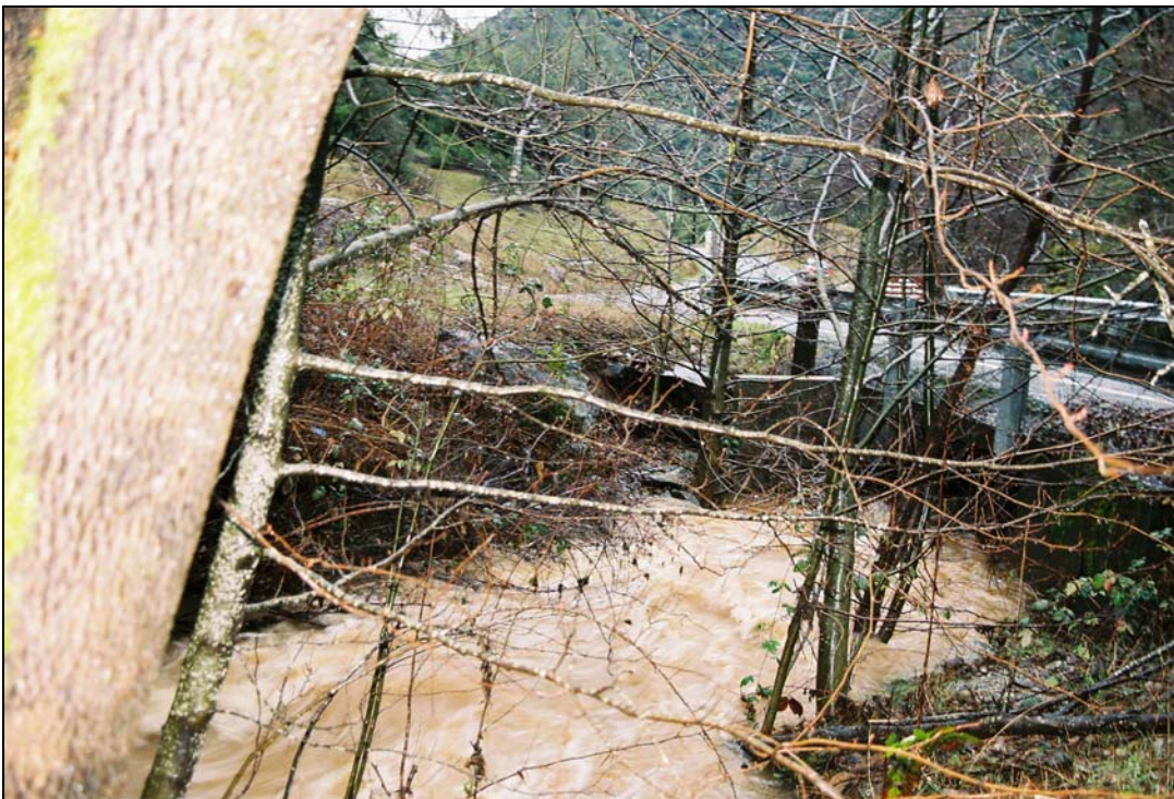
Photo 4. Tributary to N. Fork American River at Iowa Hill Rd. and Mineral Bar Area, Auburn State Recreation Area