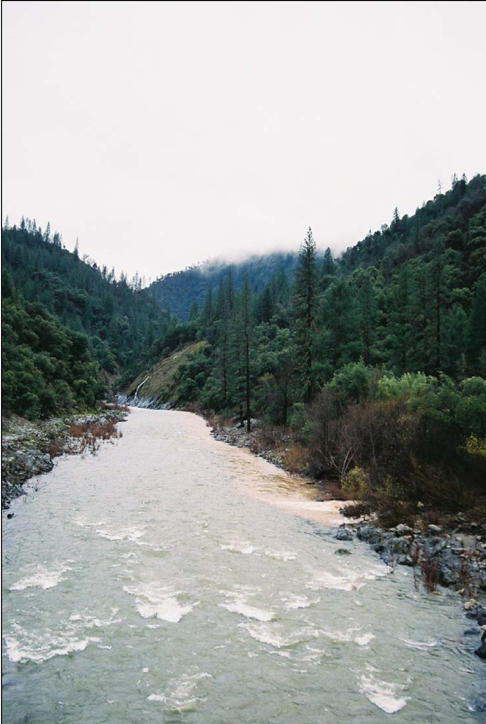
Photo 2. Sediment plume N. Fork American River from sediment-laden waterfall. Looking downstream from Iowa Hill Rd. Bridge on N. Fork American River.